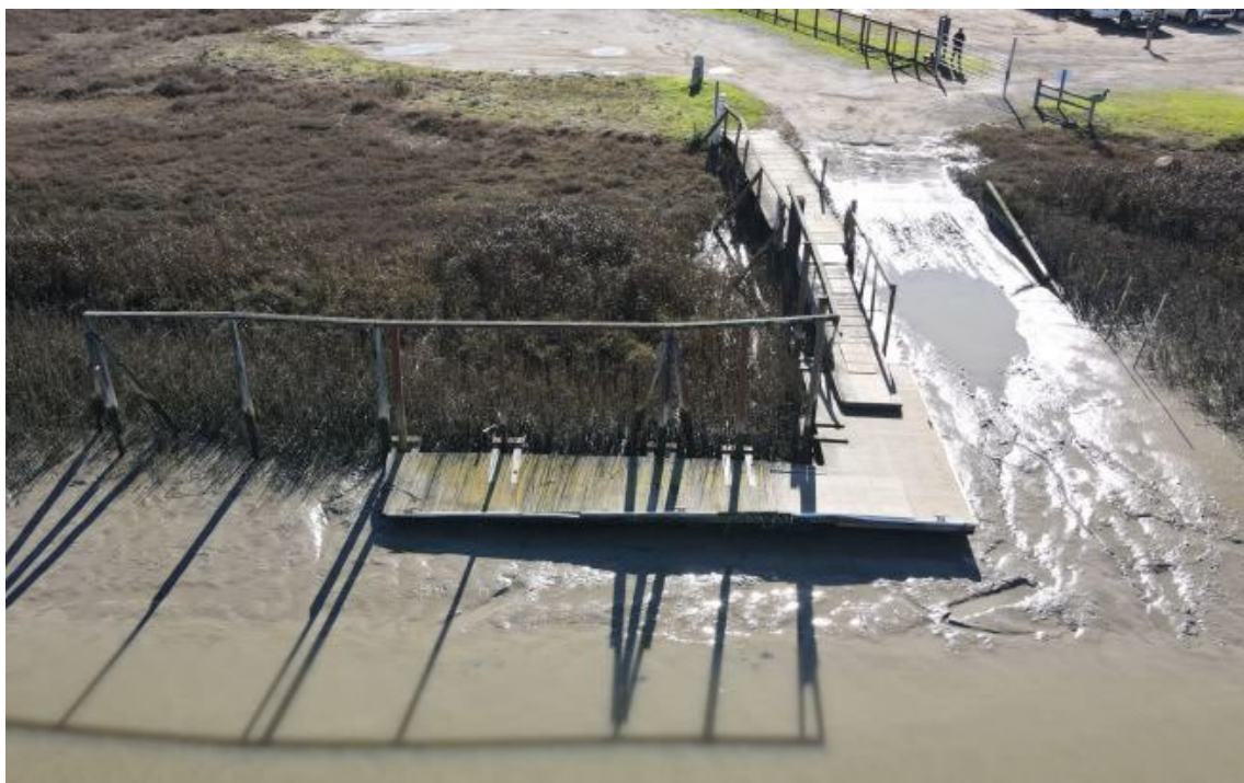
Pier and float at low tide, January 2025.