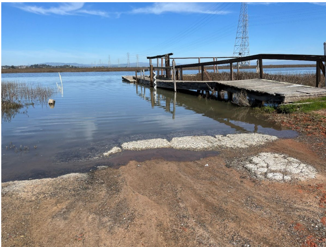
Pier at high tide, February 2025.